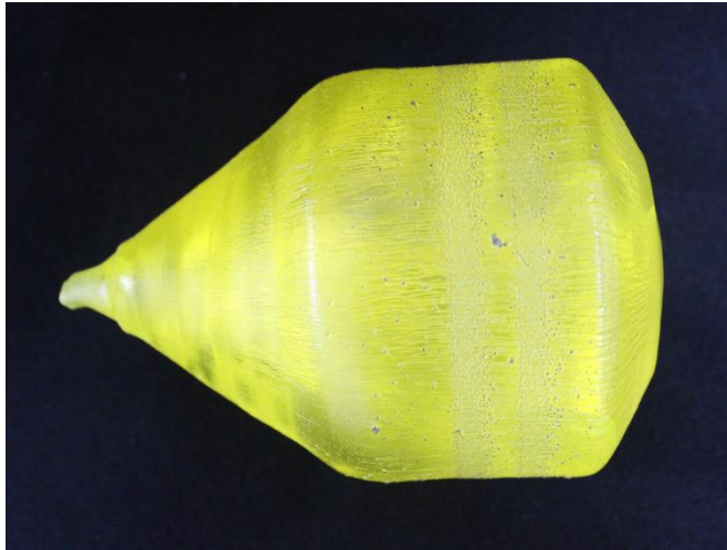
Fig.1: Photograph of 3-inch-diameter GAGG scintillator.